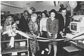
Cover image: NC LIVE Ribbon Cutting, Wake County Public Library, April 1998